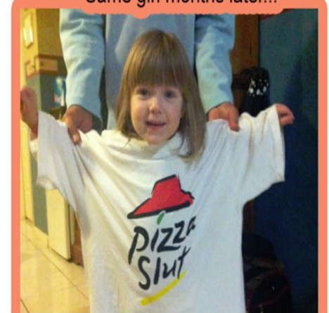
Taped Child: https://archive.is/YJJnJ